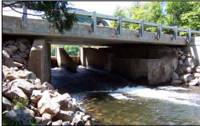
Out flow, Cisco Lake Dam

I am writing this letter to share with you my concern for the Cisco Lake Dam purchase opportunity. I want to stress to you what your property would look like and how much its value would drop if the dam is not