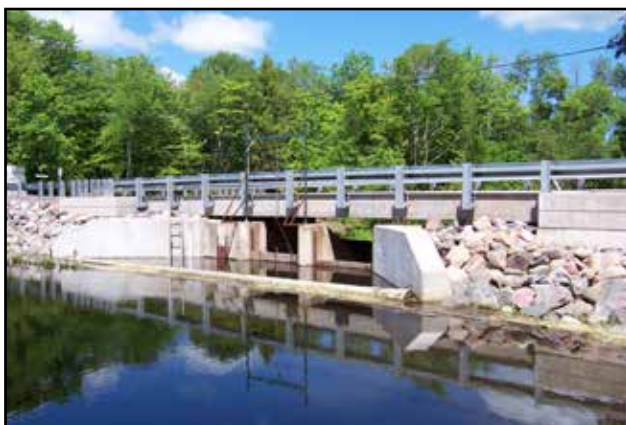
Intake, Cisco Lake Dam

contact your individual Lake Representative as they welcome the opportunity to answer your questions to address your concerns. The following